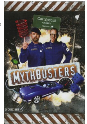
2005 Season Mythbusters episode named "Killer Brace Position"

Driving distracted is just as dangerous as drunk driving. Just check out the Mythbusters episode where Adam and Kari failed a general-purpose road safety test while talking on a cell phone. Adam commented that one can easily put away a cell phone if necessary, but not simply become sober as needed.